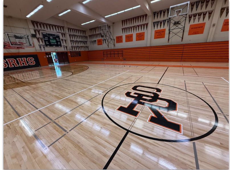
Santa Rosa High School