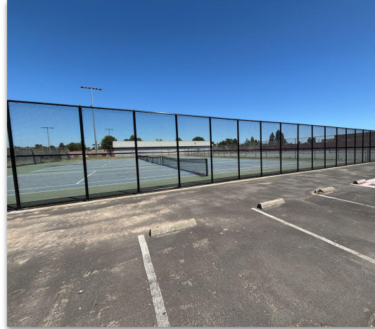
Piner High School Ball Wall Replacement