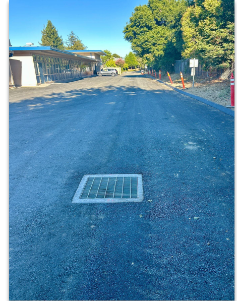
James Monroe ES Driveway Drainage