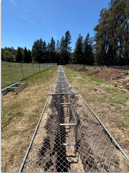
Hidden Valley ES Trenching