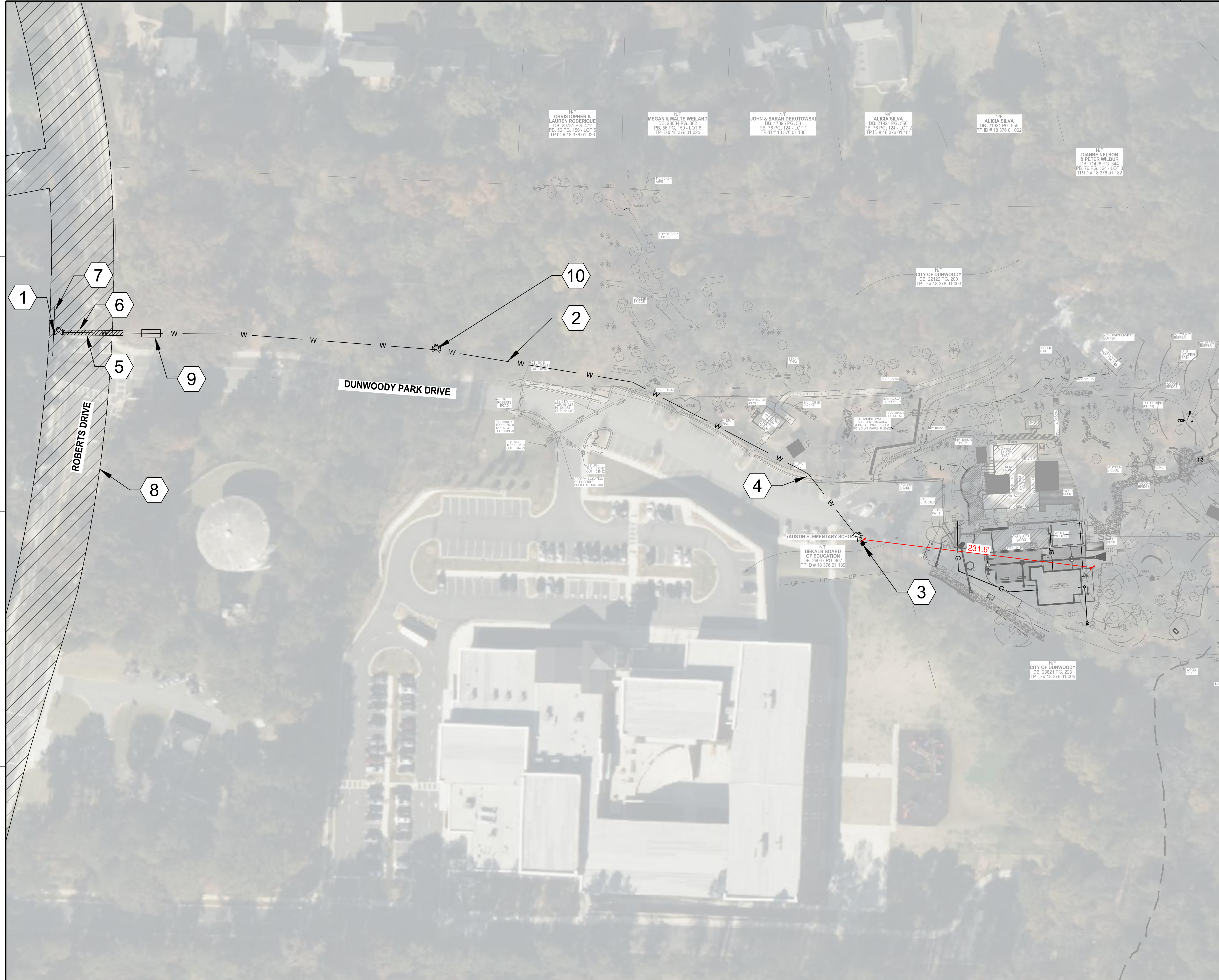
A1 UTILITY PLAN SCALE: 1" = 50'