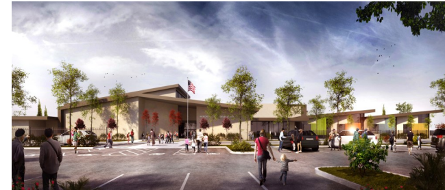
Mangini Ranch Elementary School