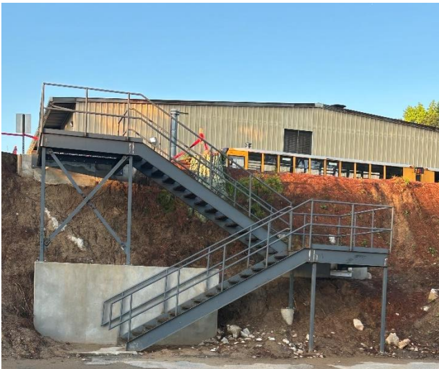
New stairs at Sam Moss