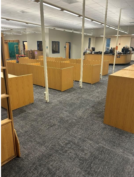
Columbia HS media center new carpet.