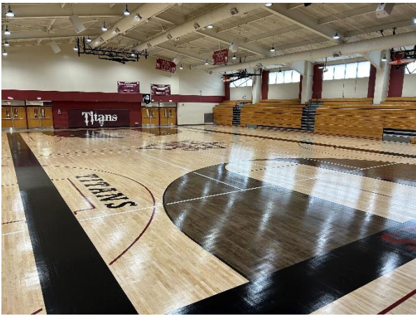
Towers HS gym floor