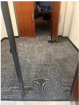
Lakeside HS auditorium new carpet.