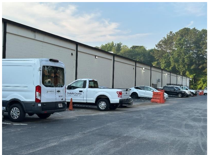
Back of warehouse painted at Sam Moss