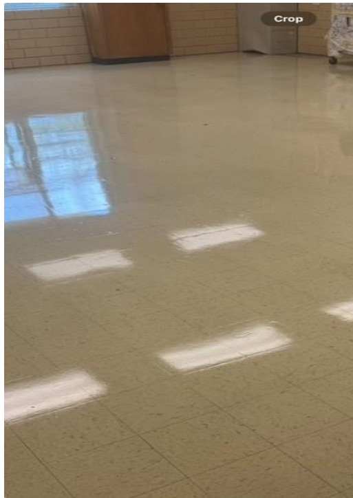
Flat Shoals ES