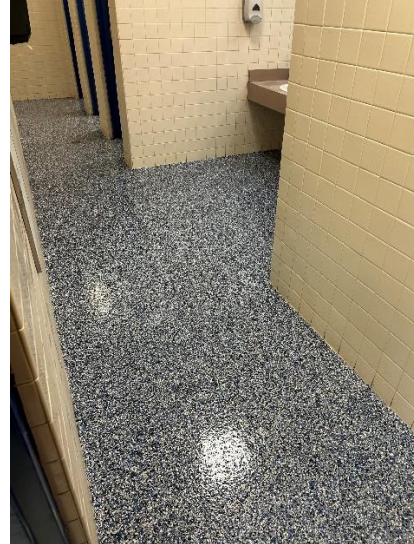
Stephenson ES new flooring.