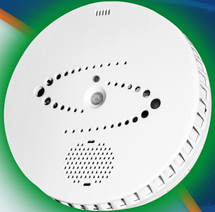
HALO Smart Sensor is Multi-Patented and Design is Trademarked

New security and environmental monitoring features provide users with even greater levels of security and easier installation. These features add to HALO's existing features of gunshot detection, noise alerts, and emergency keyword alerting.