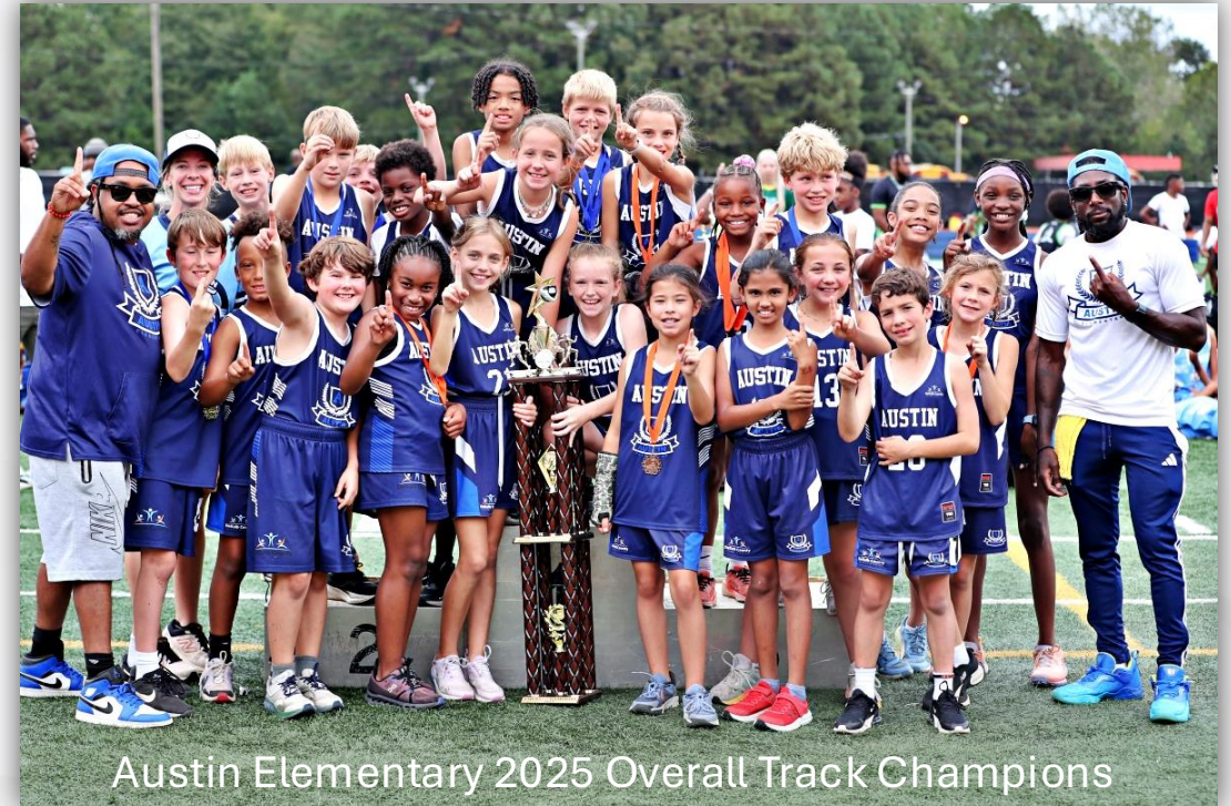
Austin Elementary 2025 Overall Track Champions