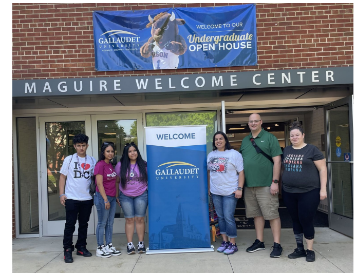
Sunnyside High School's Deaf Education Students in WA DC

Indigenous voices shaping educational pathway supports – Student Panel