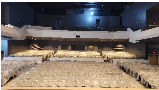
Auditorium Seating - 7/31/2022