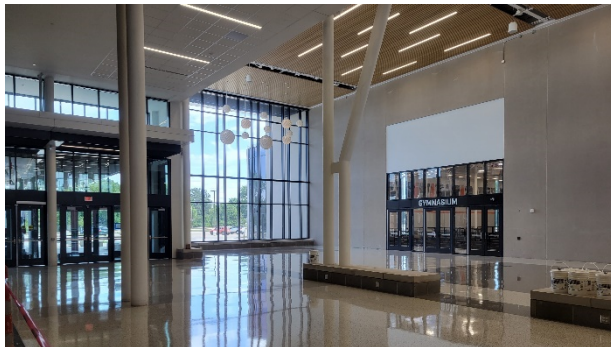
Commons (View looking east) - 7/31/2022