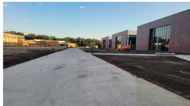
West Site Work - 7/31/2022