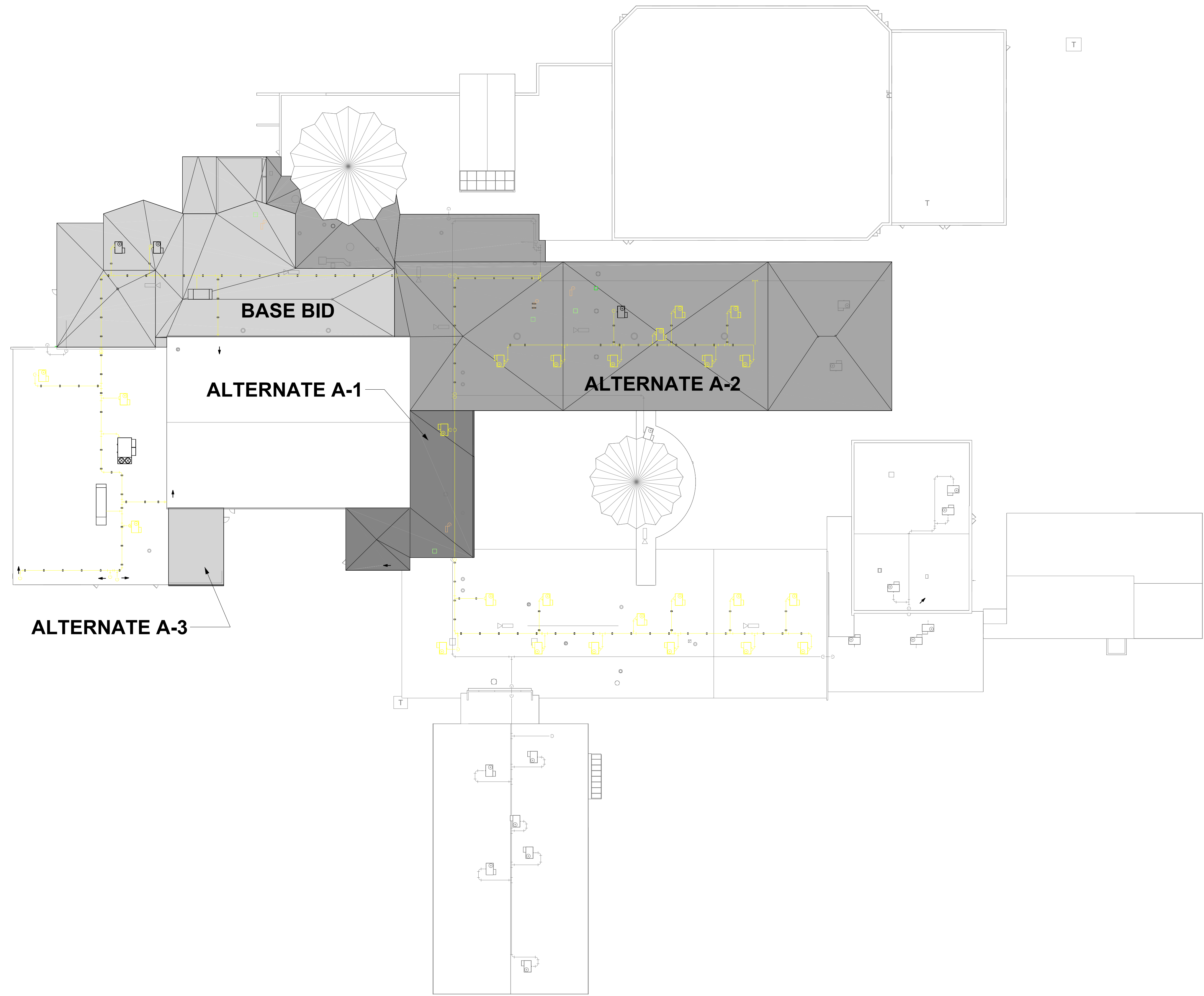
NORTH KEY PLAN - OVERALL PLAN