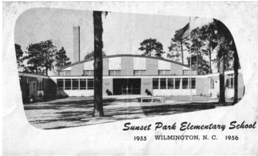
Sunset Park Elementary School 1955-56 PTA Program Cover