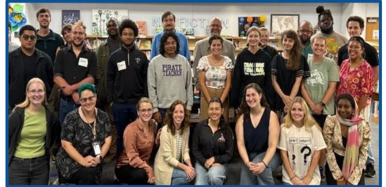
2025-2026 OCS 1st Year Teachers