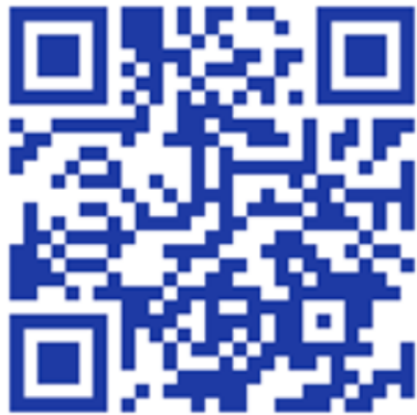
English Voting Form