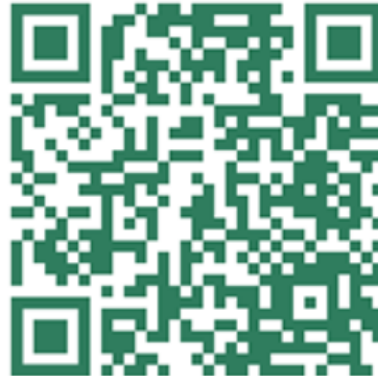
Spanish Voting Form