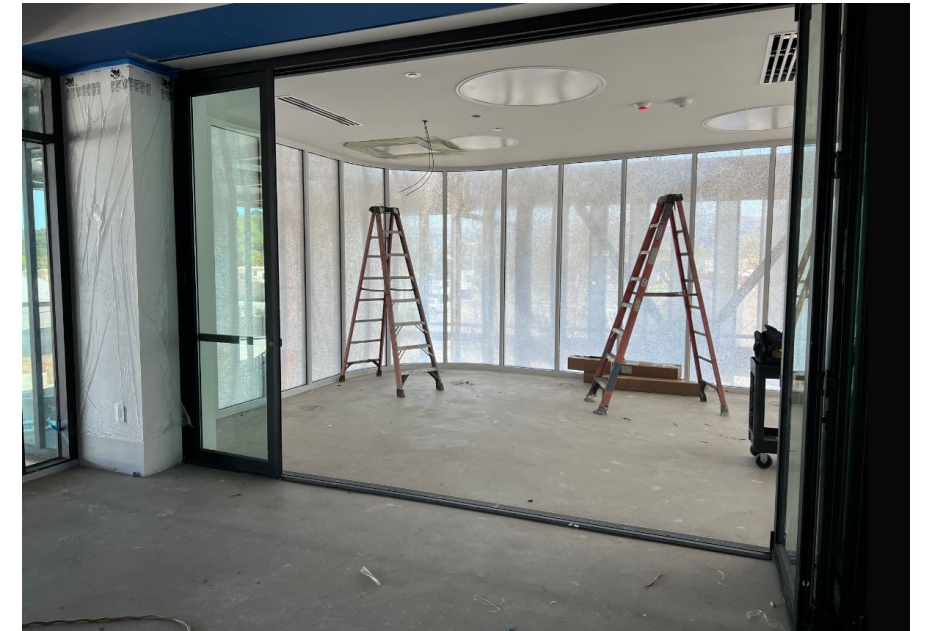
➤ Study Pod