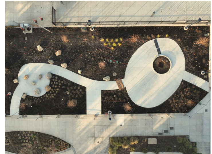
➤ Study Garden