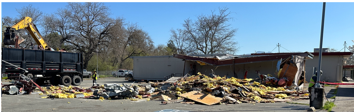
Former portable classrooms 71 and 72, Montgomery HS