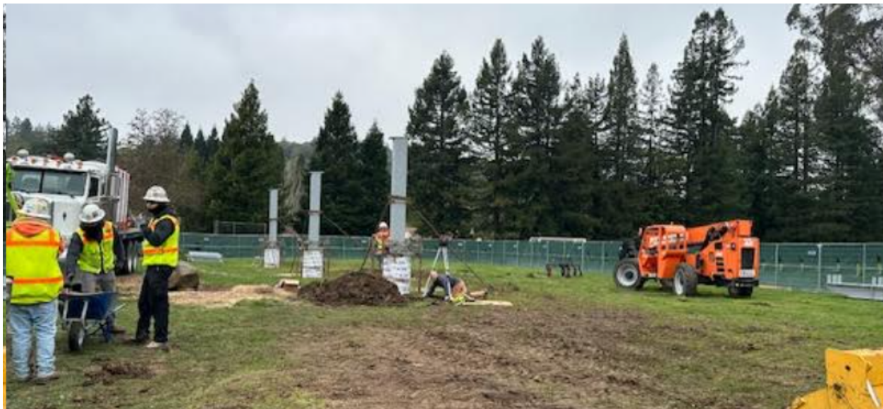
Hidden Valley ES Solar Array Columns