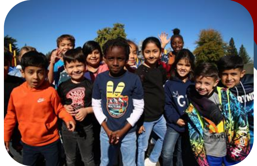
Students at Cordova Meadows Elementary