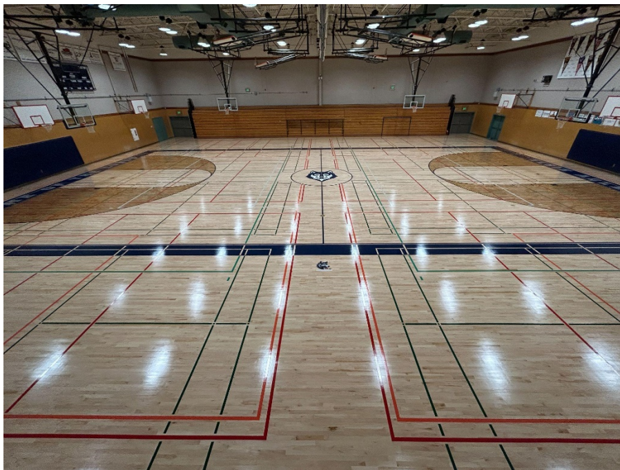
Elsie Allen High School