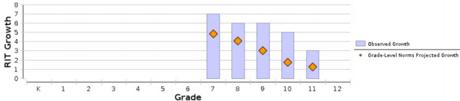
Language Arts: Reading